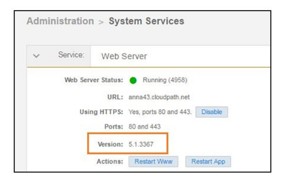
FIGURE 2 Current Cloudpath Version System Services

2. The Cloudpath version is displayed in the lower left corner of the Admin UI, and it is visible on all pages.